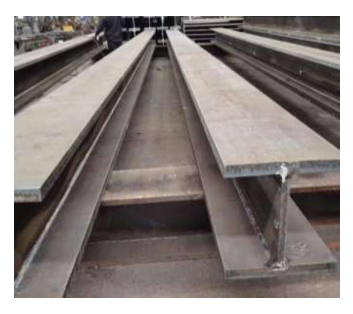
Figure 1 Welded section steel

The declared unit of is: 1 metric tonne (1000 kg) of Welded section steel OR Hot-rolled section steel.