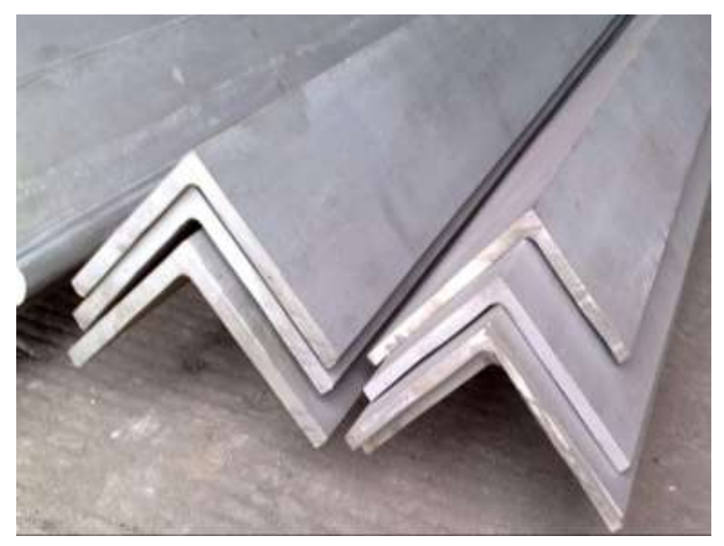
Figure 2 Hot-rolled section steel