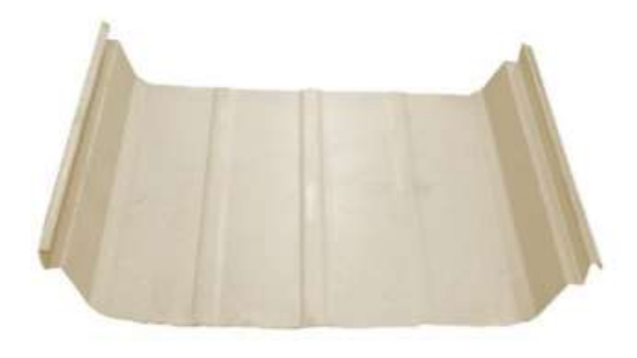
Figure 2 Profiled steel plate