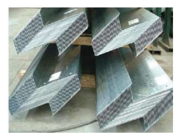
Figure 1 Cold-formed light-gauge steel members